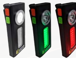
White/Green/Red Part no. 98315130