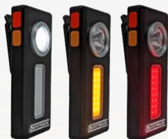
White/Yellow/Red Part no. 98315140

Flagger 650 is the improved iteration of a model launched in 2019. Two LEDs were used: a white LED with stepless power adjustment from 150 to 500 lumens , and a white COB LED reaching 200 lumens. The maximal range of the beam is 154 meters . Flagger 650 is now even easier to use and can be operated with gloved hands. Both LEDs can be activated with a single button, easy to feel with your finger. The flash-light can be also hanged on the integrated hook or firmly attached to metal surfaces (rail/pole/car etc.) with built-in magnets located in the back and in the base (see pictures above) . Flagger 650 is powered by a rechargeable battery, good for up to 2.5 hours in the highest power mode and even 7 hours if only the COB LED is used . The kit includes a MicroUSB cable for recharging the flashlight.